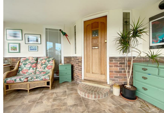
Bay Fronted South Facing Lounge 15'9 x 16' (4.80m x 4.88m)